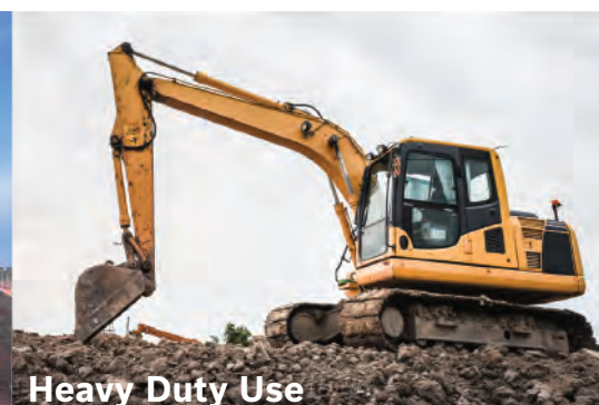
Heavy Duty Use